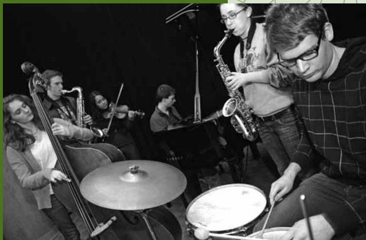
The Dakota Combo

*Tickets are $20 for adults, $15 for seniors and youth (ages 6–18)