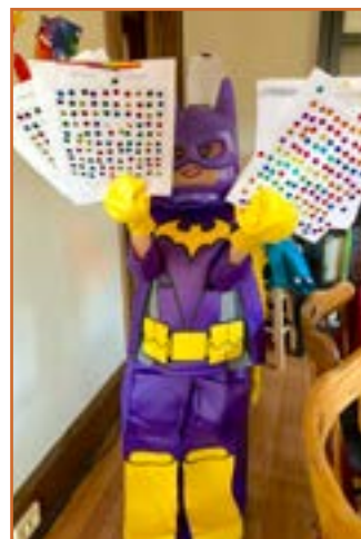
Ruby Delaney , 600 Days of Practice completed on Halloween!